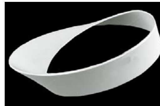
Fig. 4 A Möbius strip

series of recipes to be applied to everyday life or, at best, to science. It rarely has anything to do with the “beauty” of mathematics. But in order to understand this beauty, one must first encounter it: would you be able to imagine how beautiful music is if you had never heard a single melody? Fortunately, it is perfectly possible for non-mathematicians to encounter “real” mathematics. It could be, for instance, through the Platonic solids that we mentioned above, or through Euler’s formula, which is discussed on pages 172–173; or through Lagrange’s theorem, which states that any natural number is the sum of (at most) four square numbers; or through the mysterious Möbius strip that has only one side and one edge (fig. 4). Seeing objects such as these is bound, in my opinion, to kindle a certain amount of interest in mathematics in many people, both young and old, who have never felt it before. And that is of course the aim of the exhibition Mathematics, A Beautiful Elsewhere : to provide an encounter with “beautiful” mathematics.