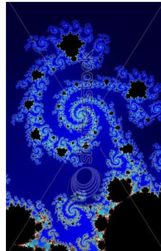
Fig. 2 An example of a fractal object, a mathematical concept introduced and developed by Benoît Mandelbrot during the 60’s and the 70’s

Finally, I would like to say a few words about the influence of computers on present-day mathematics. This influence is in fact much less than is usually thought, and computers have no more replaced mathematicians than typewriters have replaced writers. They are only tools. Nevertheless, they are without question extremely useful. First of all, there is the obvious aspect: computers can perform lengthy numerical or algebraic calculations that no human being could or would ever want to do, and they are indispensable for simulating or modeling complex systems. But there is